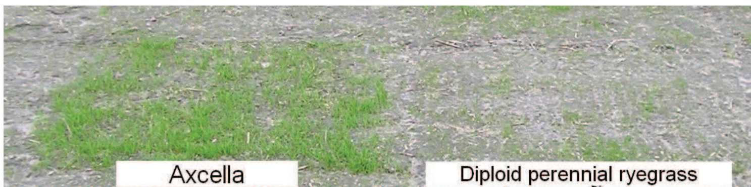
Axcella 1 compared to perennial ryegrass in March 2011, two months after sowing in Moerstraten-NL in January

Axcella compared to ordinary annual ryegrass